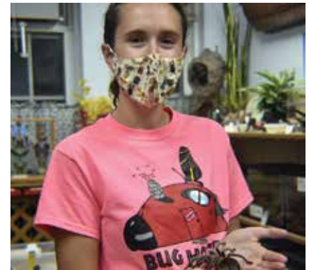
Eschedor in the MSU Bug House.