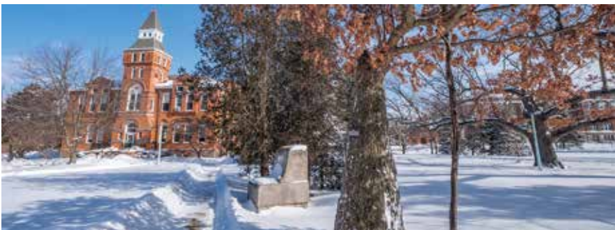
Derrick L. Turner, MSU Photography

According to medical entomologist Ned Walker, this is a horse trough gifted by the class of 1900. The entomological twist is it has been a frequent mosquito sampling site, including sampling for the invasive Aedes japonicus (see https://academic.oup.com/jme/article/49/6/1307/964300 ).