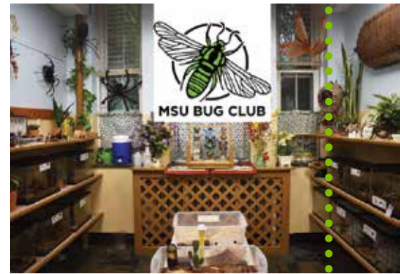
The club's logo is modeled after the Sesia spartani moth.

Learn more about the club on Instagram and Twitter @bugclubmsu.